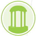
UNC Chapel Hill